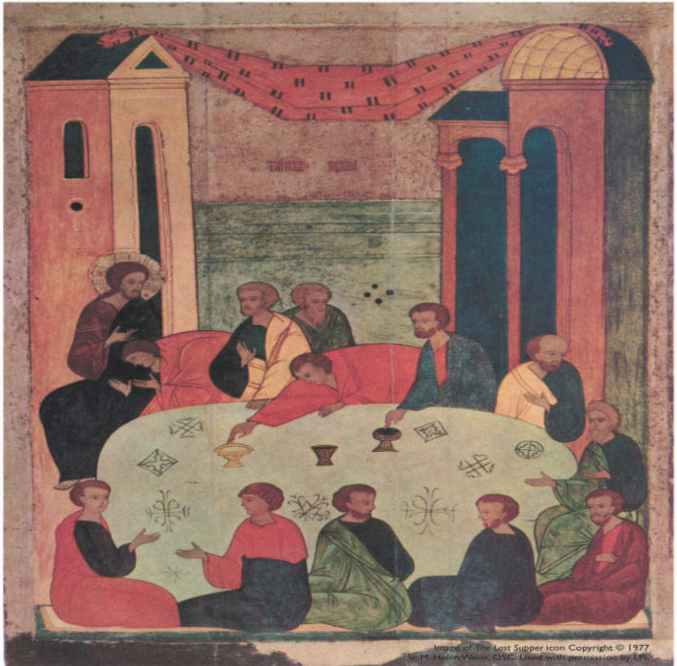
Image of The Last Supper icon