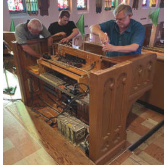
The organ restorers dismantling the organ, preparing it for transportation to their shop for the rebuild.