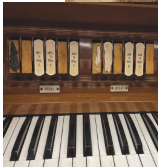
Broken coupler tablets. Take note of the missing ivory cover plates and splintered keys.