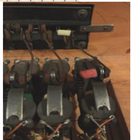
A coupler mechanism that Joe patched together with two pencil erasers.